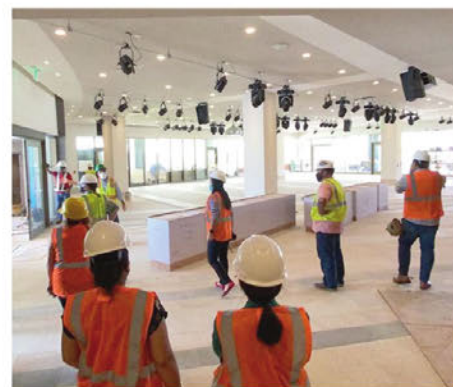
TOUR: Guam Chamber of Commerce officers are seen Friday in a tour of the Tsubaki Tower luxury hotel project, which has announced a July 1 opening date.

The project is another development of PHR Ken Micronesia Inc., an operational company for the hotel holdings in Japan-based Ken Corp. Group.