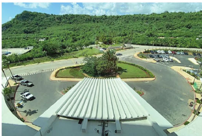
OPENING SOON: The Tsubaki Tower is expected to open in July.

of the Guam Chamber of Commerce were given a tour of the hotel on Friday.