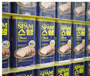
SPAM: Cans of CJ CheilJedang Spam ham sit on the production line at the company's factory in Jincheon, South Korea.